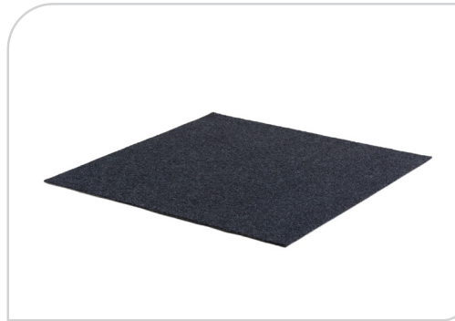
Optional Refuge Tiles Available